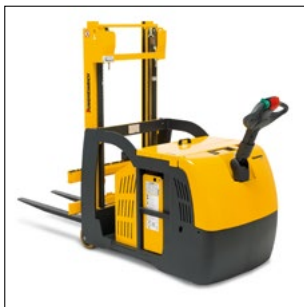
Ergonomic operating handle