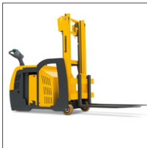
Increased ground clearance with large load wheels.