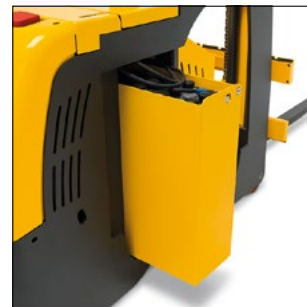
Lateral battery exchange (optional)