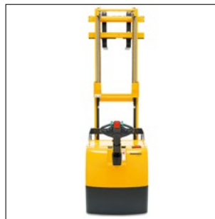
Excellent view of the load for precise positioning